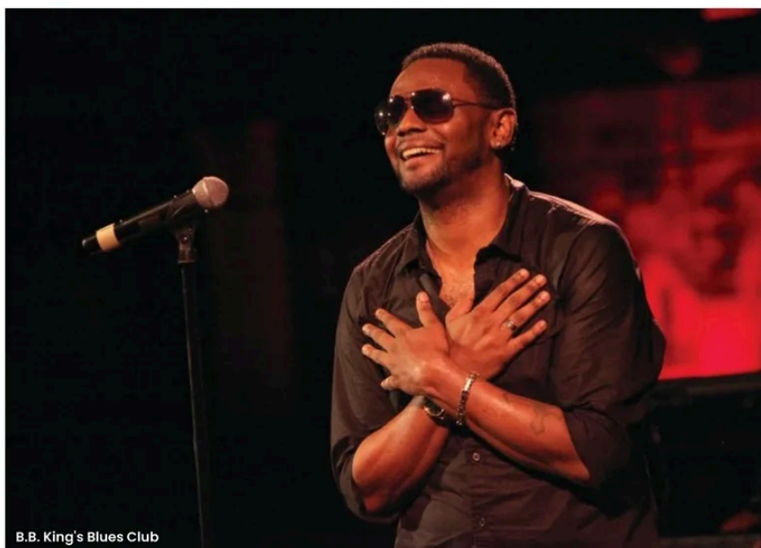
B.B. King's Blues Club