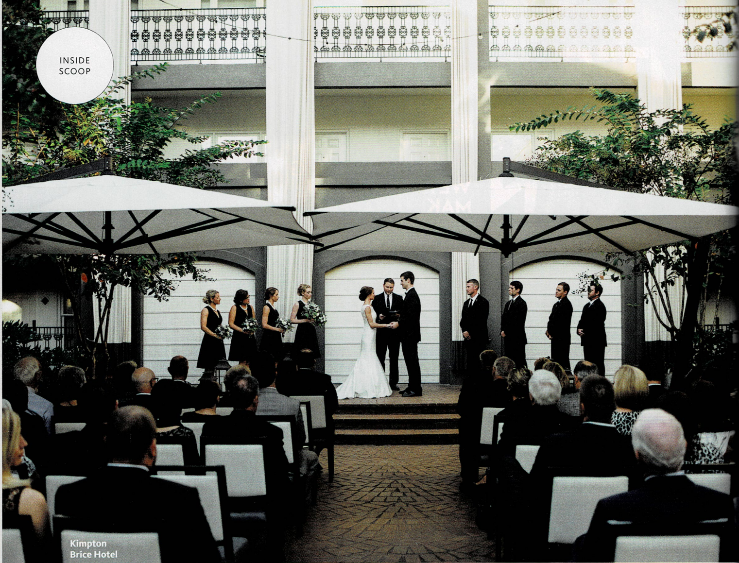
Kimpton Brice Hotel