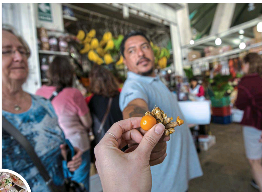
Melt in the mouth: main image, fruit tasting on Best Bite Peru's food tours. Inset, learning how to make ceviche

I join his tour and cooking class, beginning at the Municipal Market of San Isidro in the leafy district of Miraflores, and the array of fruits and vegetables makes my head spin. Everything is bright, bold and huge. Husks of deep-purple corn are piled alongside pacay, giant green pods containing sweet, creamy beans. I taste